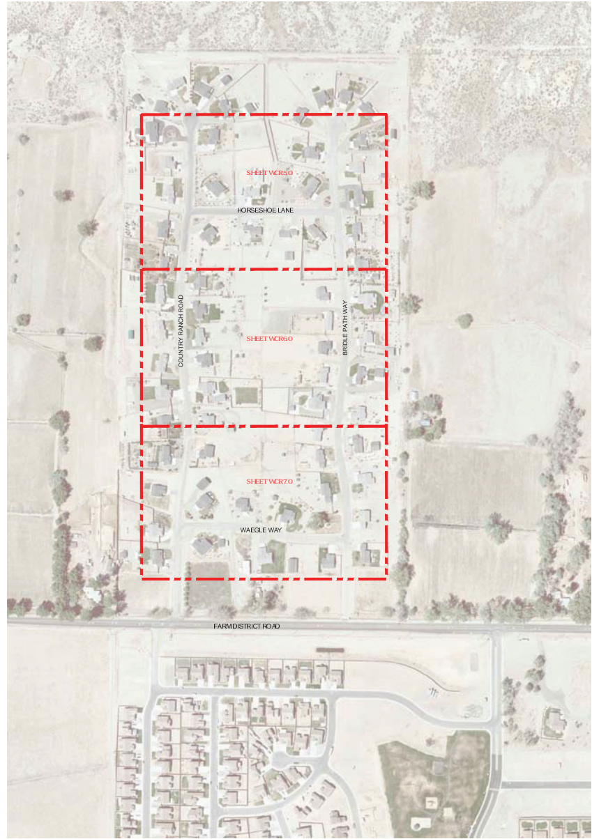
COUNTRY RANCH SUBDIVISION